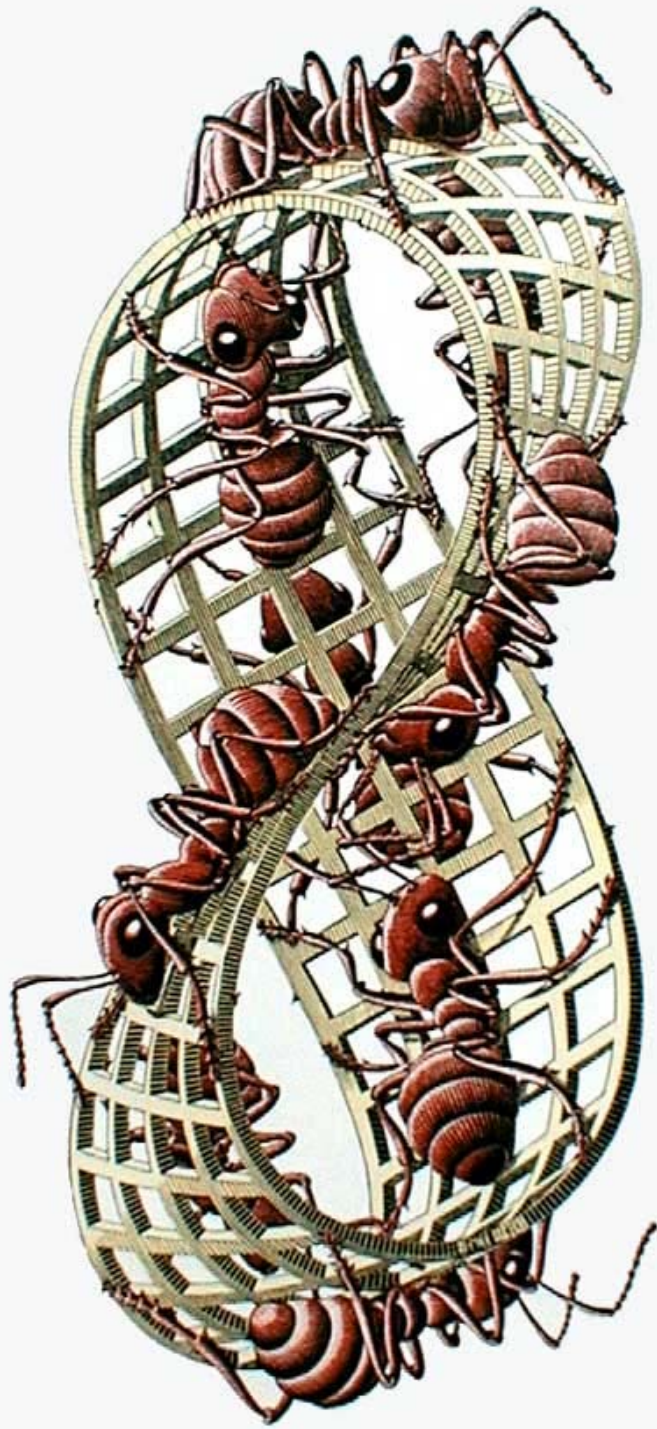
Illustration by [unreadable] for [unreadable] magazine, [unreadable] year.